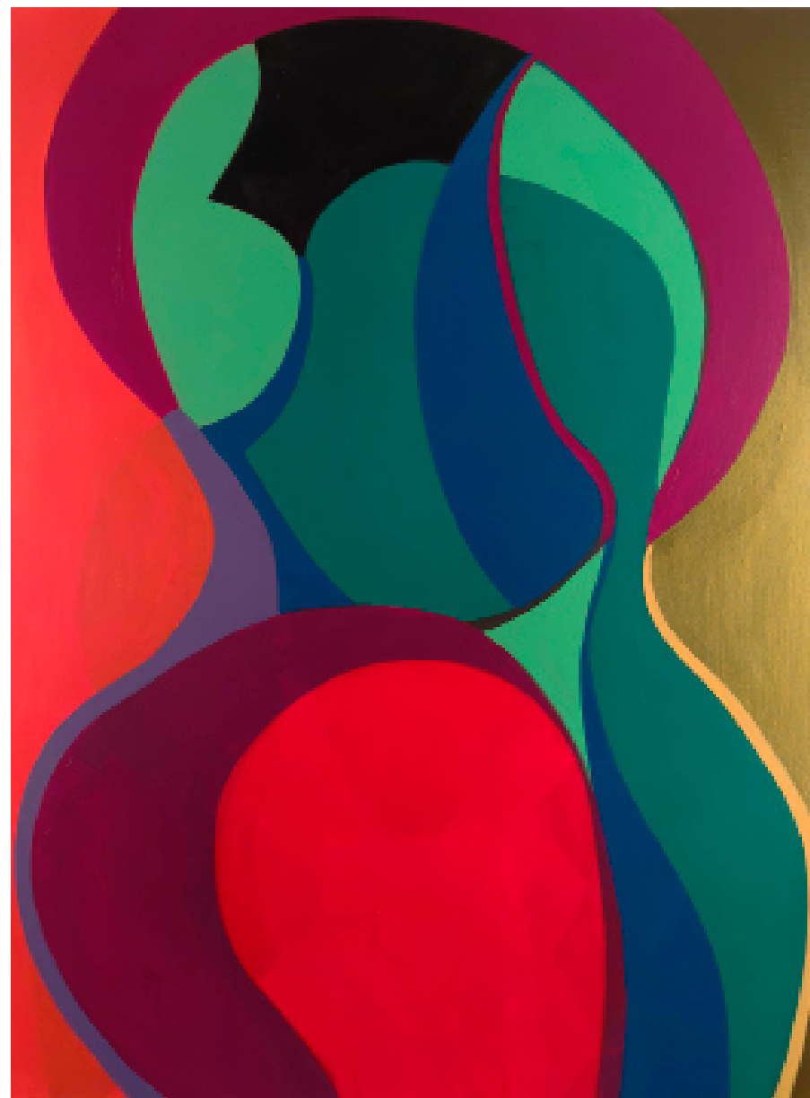
Spirited Away , 2023 Acrylic on canvas 48 x 36 inches