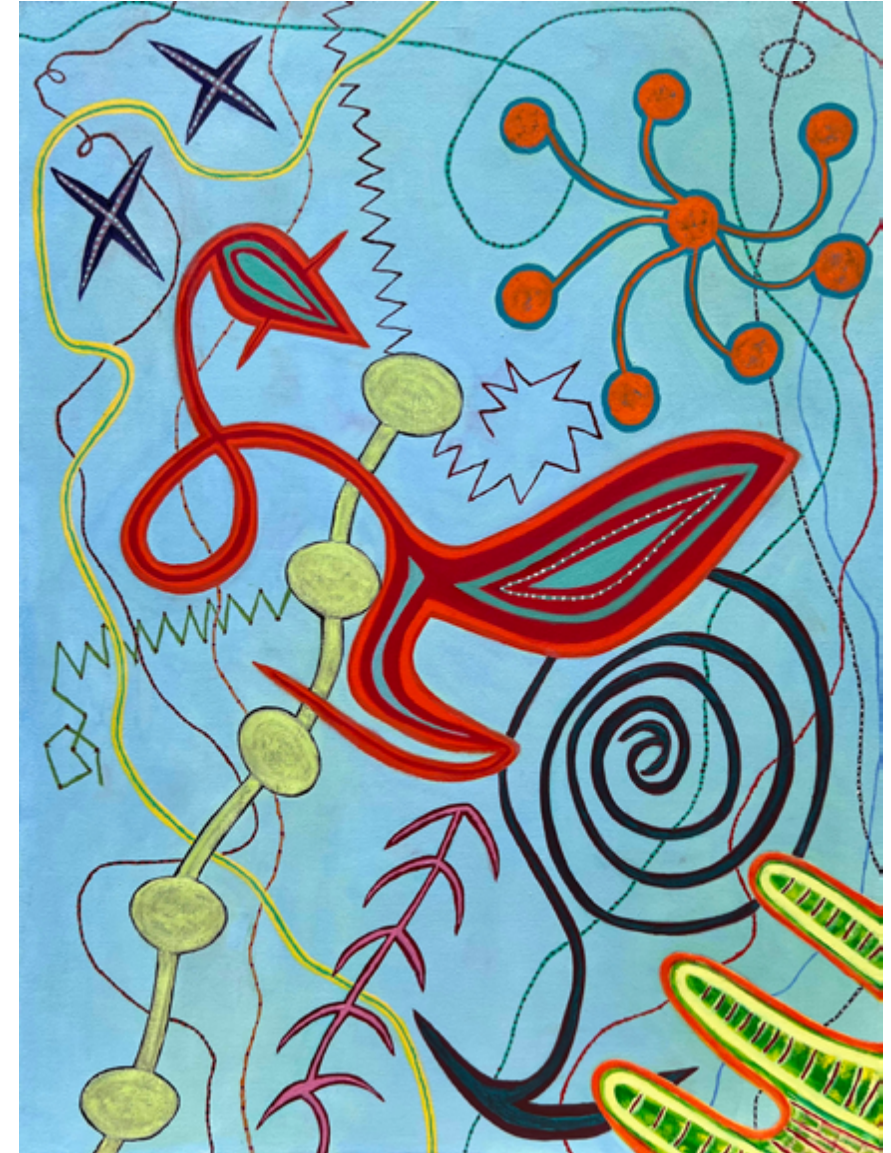
Feeling Hurried , 2023 Oil on canvas 40 x 30 inches