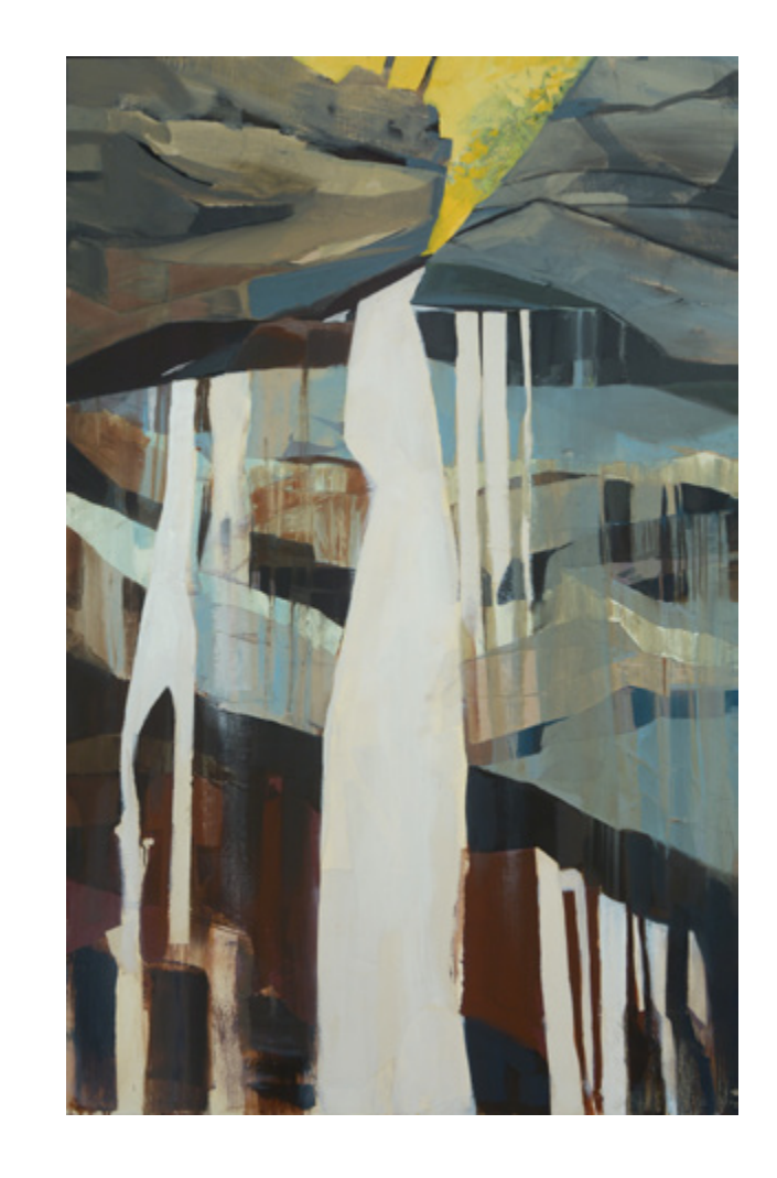
Mariella Bisson Bridal Veil Falls, 2005, Collage, watercolor and gouache on paper, 50" x 40"

Mariella Bisson Waterfall Cliff, 2017, Oil and mixed media on linen, 60" x 38"