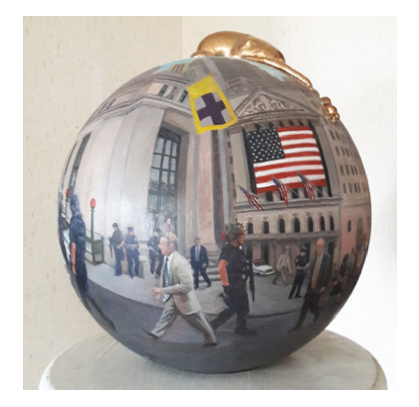
Jackie Lima New York Stock Exchange , 2005, Oil on plastic and foam sphere, 15" x 15" x 13"

Jackie Lima 8000 Miles, 2014, Acrylic on paper, 8" x 24" x 24"