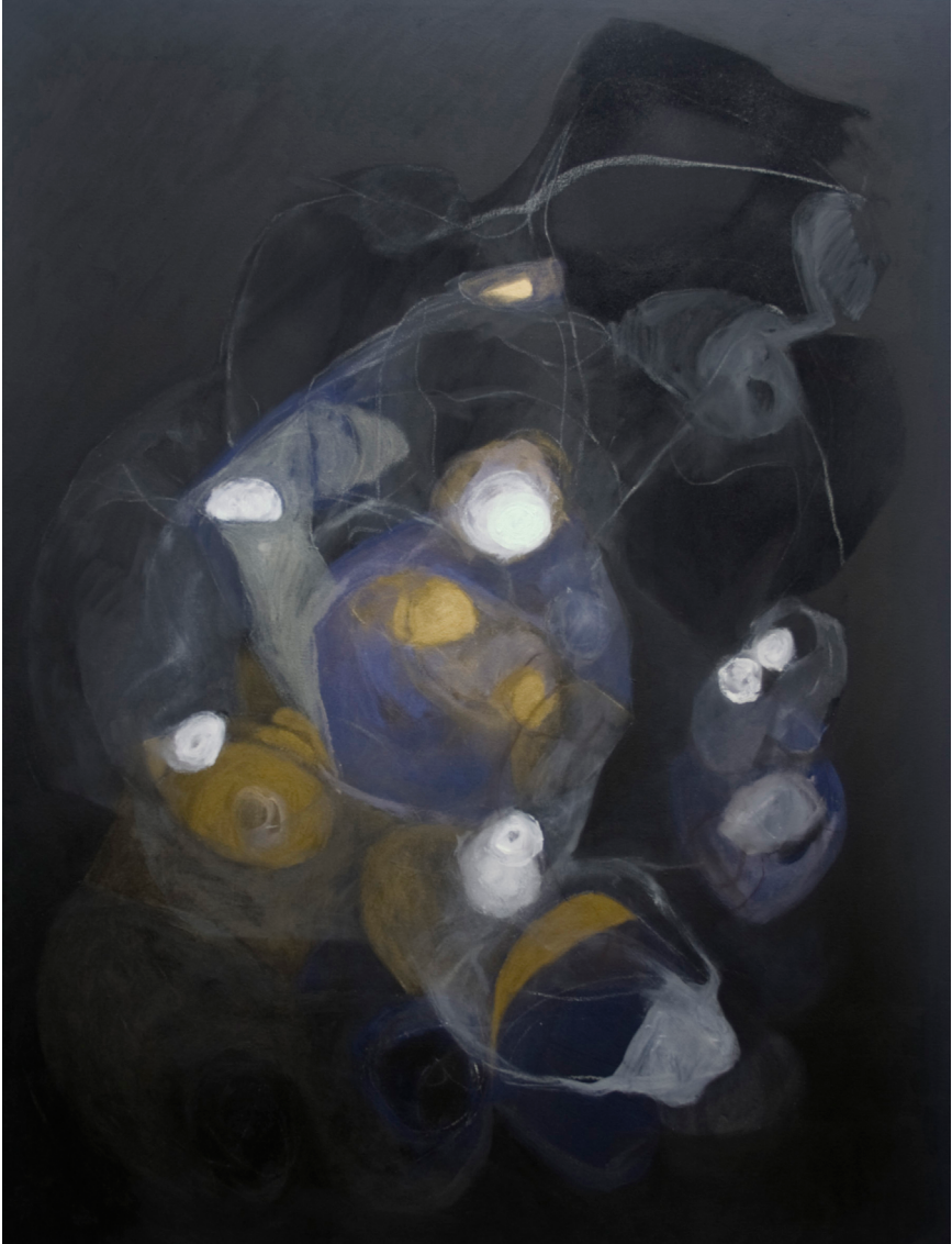
Above: Rutland, 2012, oil and wax on canvas, 48" x 36"