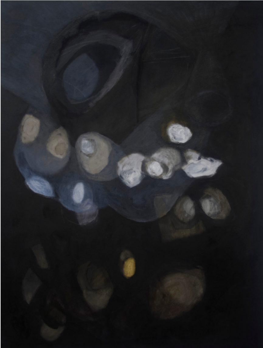
Thirty Years, 2012 , oil and wax on canvas, 50" x 36"