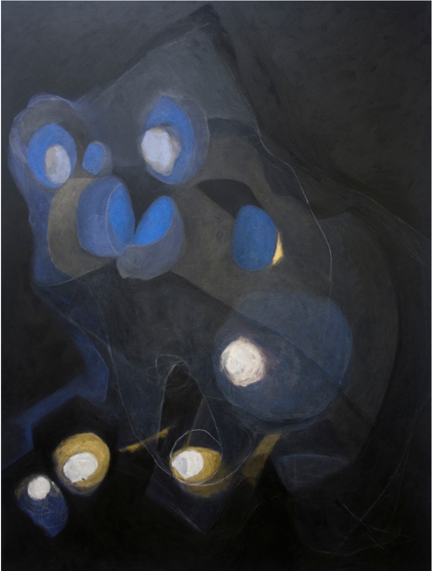
Reis, 2012, oil and wax on canvas, 48" x 36"